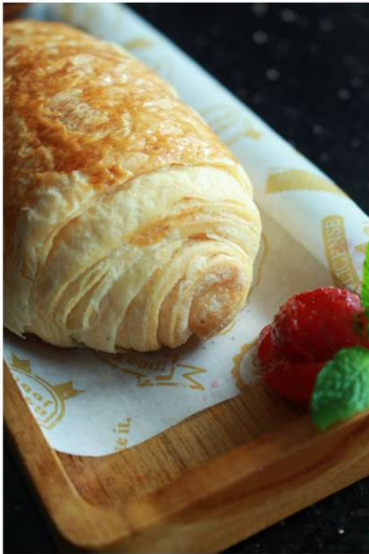
CHOCO DANISH IDR12,000

A multi-layered sweet cake made from puff pastry with chocolate filling served with fresh strawberry