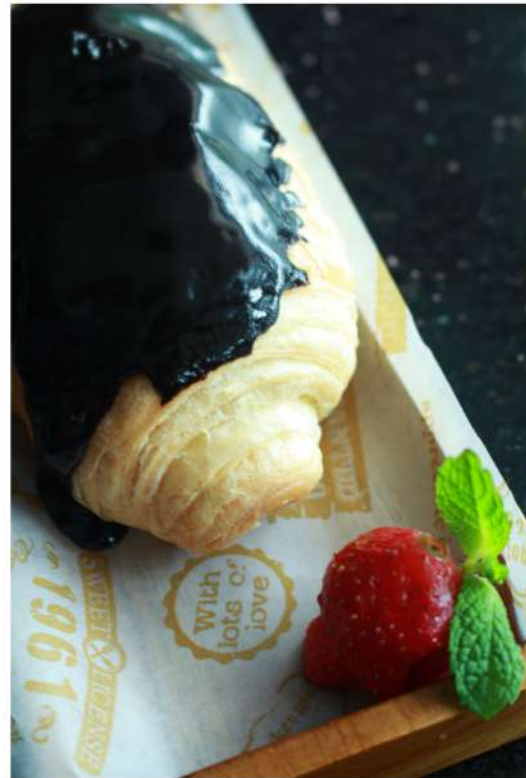
DOUBLE CHOCO DANISH IDR18,500

A multi-layered sweet cake made from puff pastry with chocolate filling served with fresh strawberry